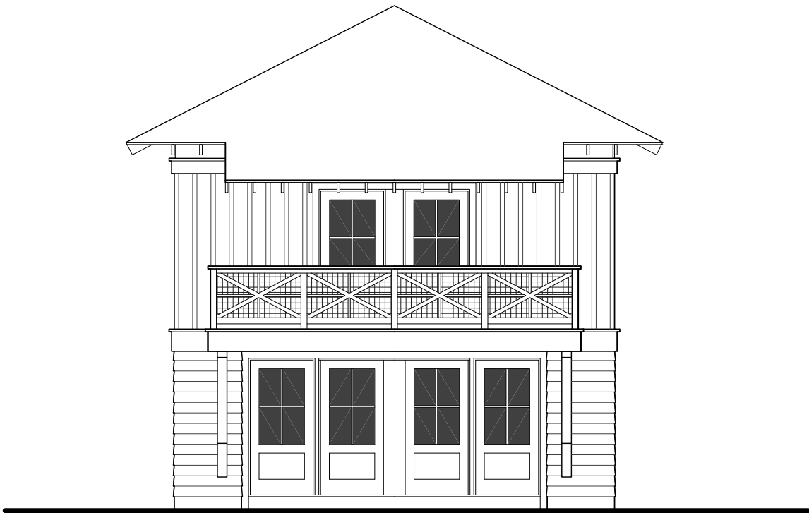
01 STREET ELEVATION 1/8"=1'-0"